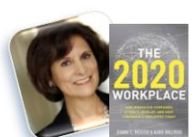
The 2020 Workplace

Abbott AchieveGlobal Allen Communication Alverno College A.O. Smith Aurora Health Care Baxter Blackboard